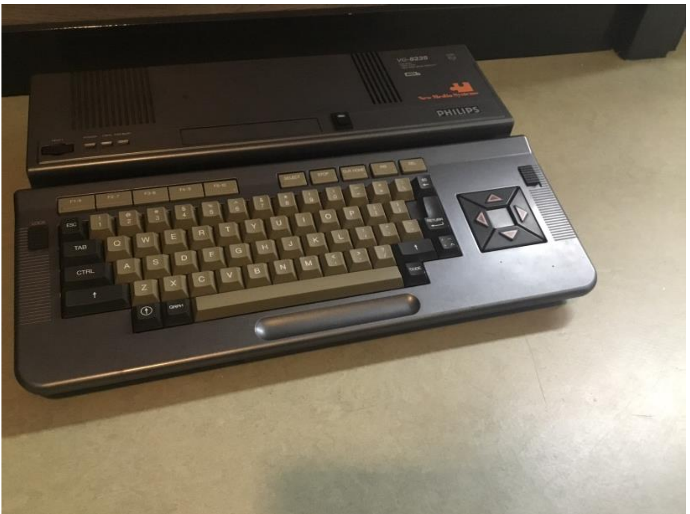
The Philips VG 8235 MSX-2 computer.